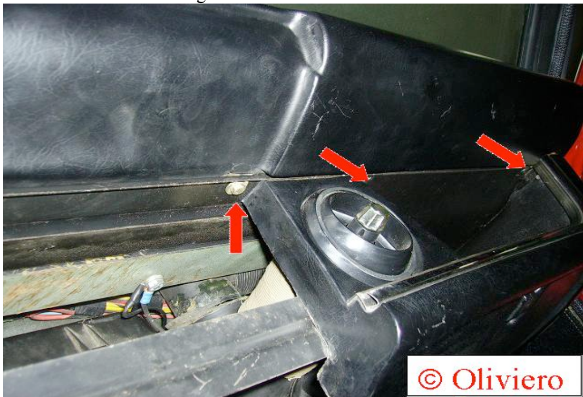
After having done so, you can move apart the upper part of the dashboard.

Then turn to the center - there are also 2 screws, at last there are 2 little black hexagon sockets in the console above the glove box.