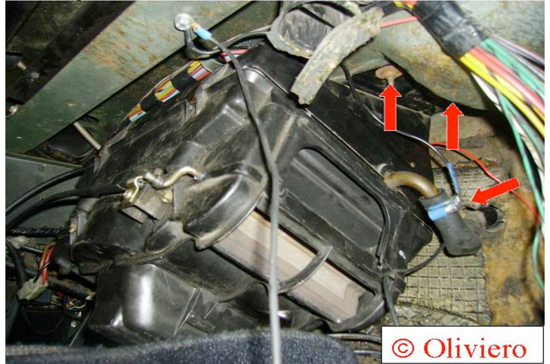
Now you have to dismantle the heating unit: